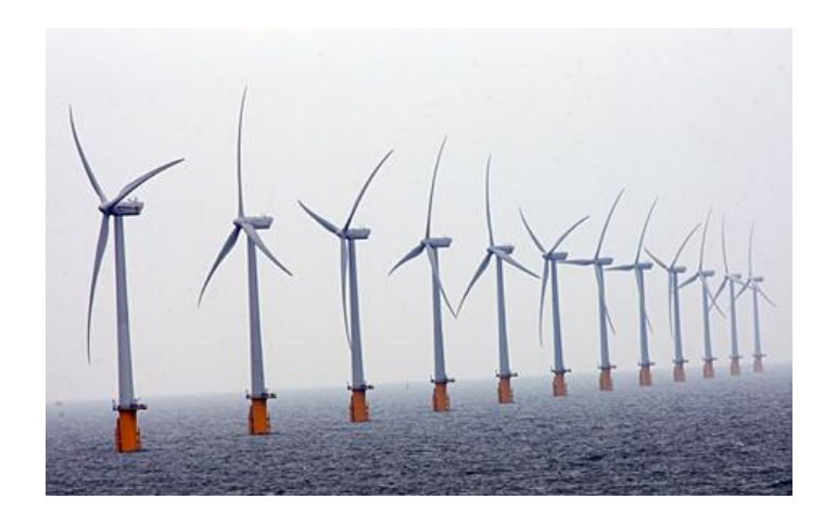
Thanet Wind Farm off the coast of Kent. This should stop the Armada and maybe the Luftwaffe too.

"Every time we were building onshore, the public reacts in a negative way and we had a lot of criticism from neighbours," said a spokesman for the government owned wind company. "Now we are putting all our efforts into offshore wind farms."