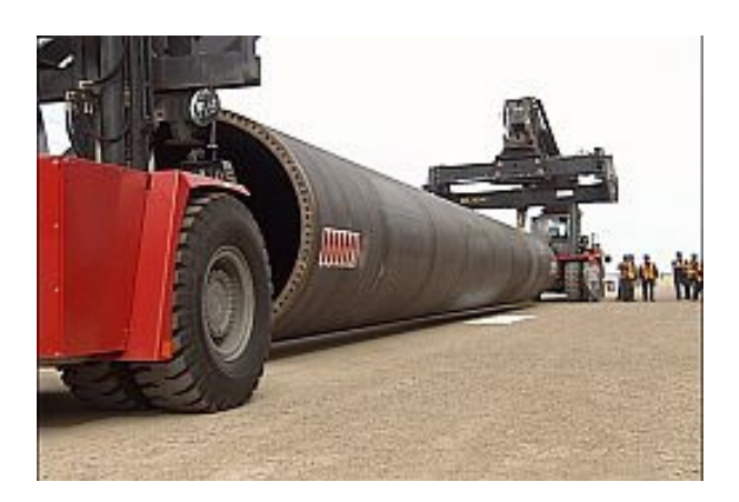
Imagine the Roads needed to install thousands of these Monsters

The most obvious environmental degradations caused by wind power are the landscapes scarred and vistas uglified by the thousands of massive turbines with their high impact roads and transmission lines.