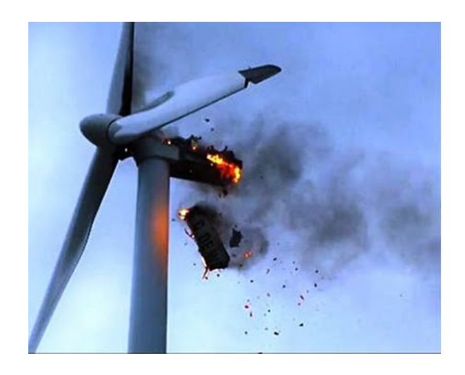
Here is what happens when transmission failures occur in windmills. To date no gear oil has been invented to withstand the pressures produced. Many gearboxes, designed for a 20-year life, are failing after 6 to 8 years of operation.

So a new type of generator was developed with many permanent magnets set around the rotor. With a somewhat increased diameter and very strong rare-earth magnets, it is possible to generate electricity at the low rotation rate (RPM) of the turbine without need for a gearbox. However, the resulting need for about two tonnes of rare-earth elements for each wind turbine has caused a huge increase in demand for rare-earth minerals. (Conventional power plants can control their RPM to match what the generator needs and do not need rare earth magnets.)