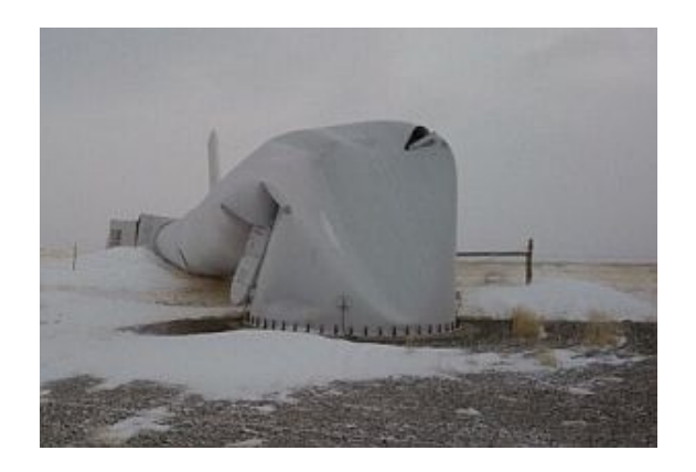
Wind Tower destroyed by Wind in Windy Wyoming