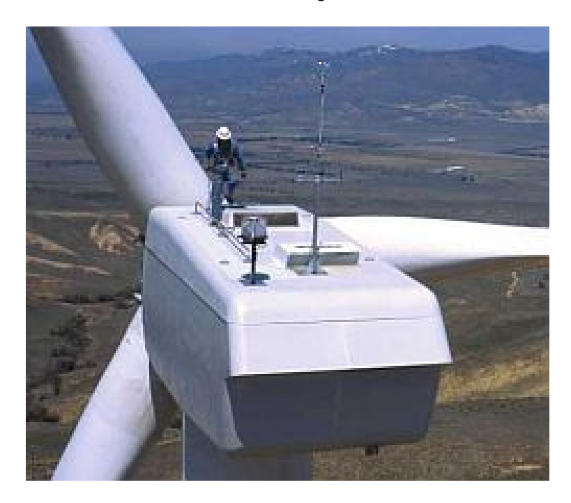
Not just a Friendly Farm Windmill.

Wind towers are a danger to workmen forced to work on small platforms at great heights sometimes in high winds.