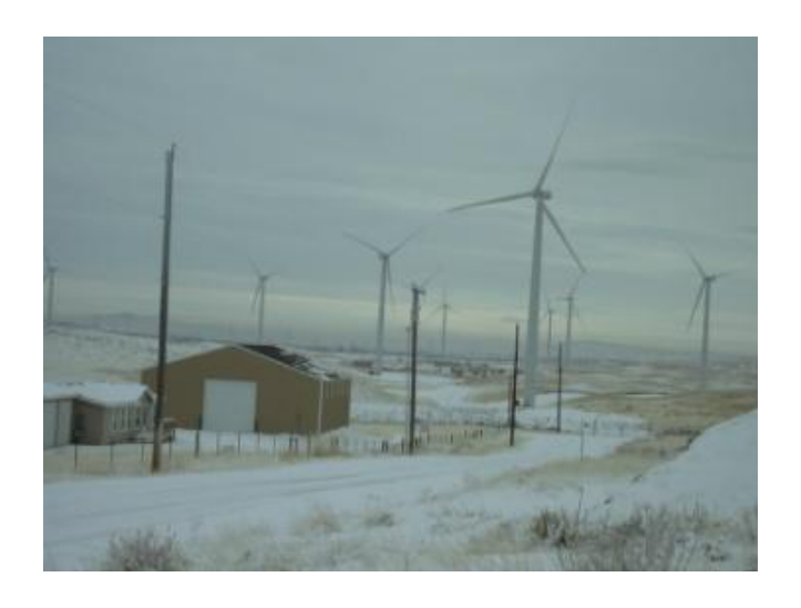
Would you like to live with a noisy dangerous Power Plant in your Backyard?

Neighbours also need to give wind towers wide berth. Some are blown down, some catch fire, and in others a blade, which may be 150 feet long weighing 14 tonnes, may snap off in high winds.