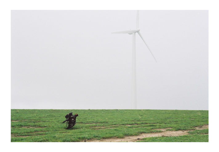
Wedge tail Eagle Maimed, Starfish Hill, Australia.