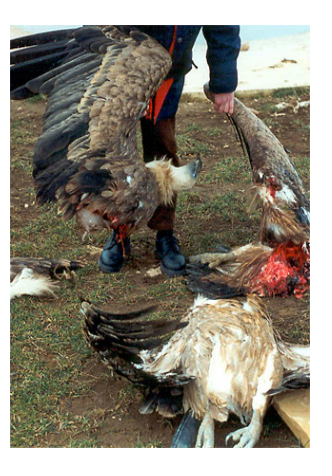
Sliced Griffon Vultures, Navarre, Spain.

Similar battles over bird kills were reported in Ireland and Scotland.